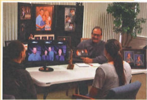
New Safety Glass at Viewing Station