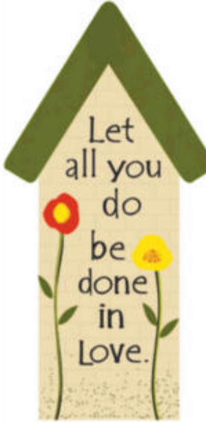
I Corinthians 16:14

RSVP to ilucas@ourladyofmercychurch.org by June 1 if you are a graduate who will be with us on June 12 or 13.